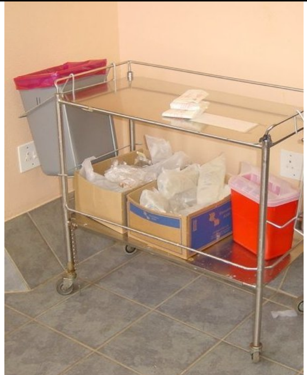
Nurse trolley with puncture proof holder for red bag