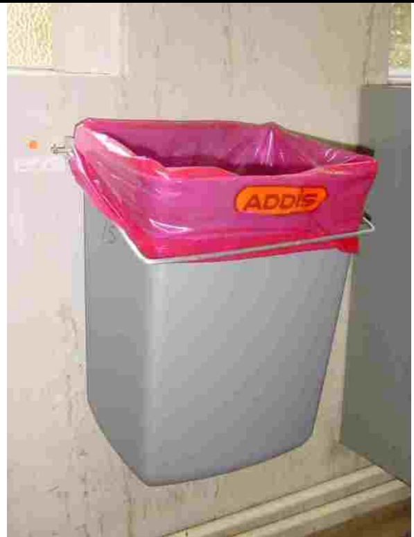
Wall mounted bin with liner in sluice room