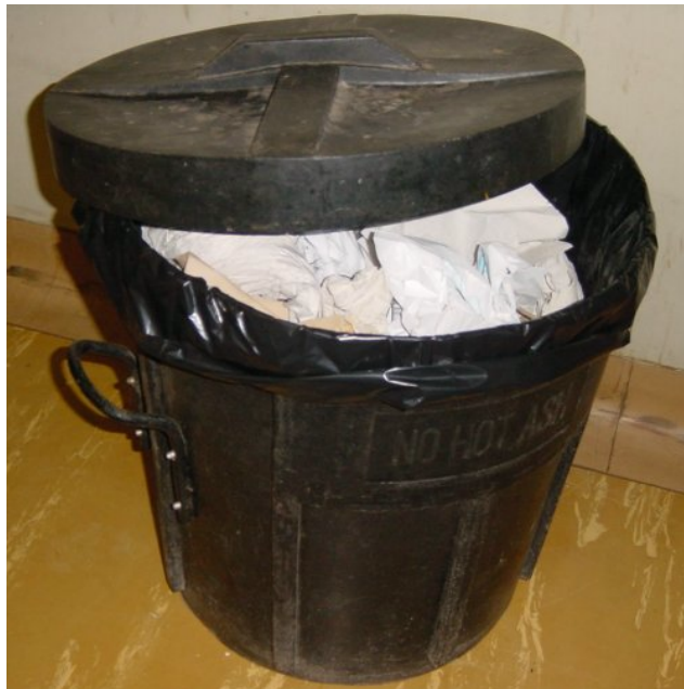
Large standing bin for domestic waste in corridors etc.