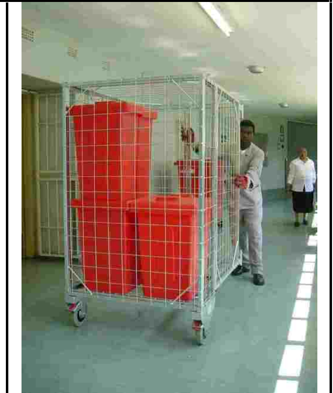
Internal collection of reusable stackable boxes in cage trolley