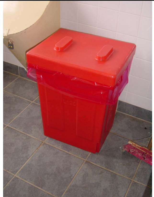
100 litre puncture proof stackable box for HCW in sluice