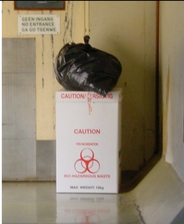
Filled sealed HCRW cardboard box awaiting collection in corridor