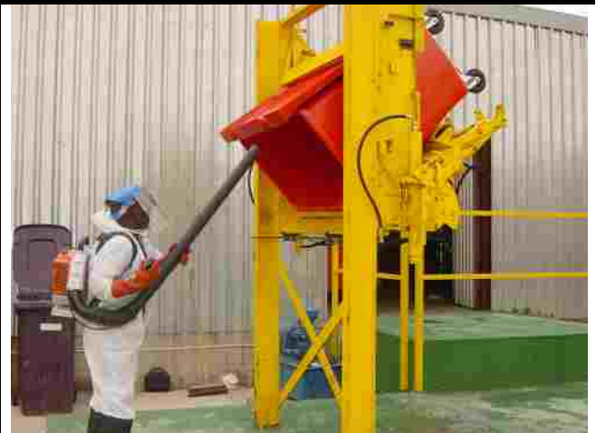
Drying of 770 litre wheelie bin after cleaning