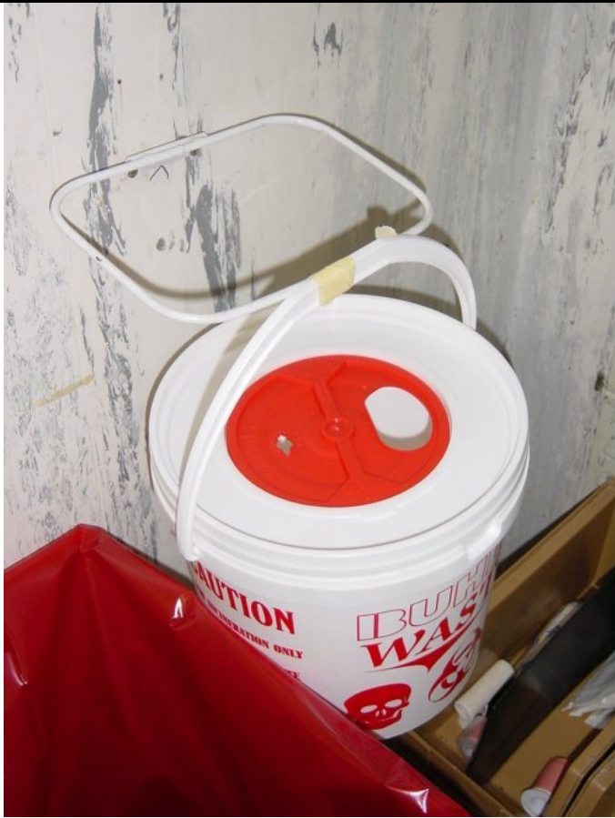
Sharps containers with large hole for direct vertical loading