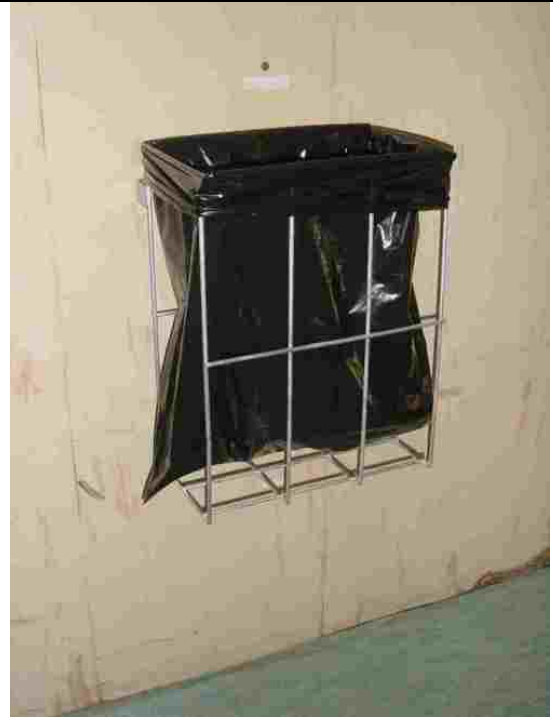
Wall mounted rack with bag for domestic waste