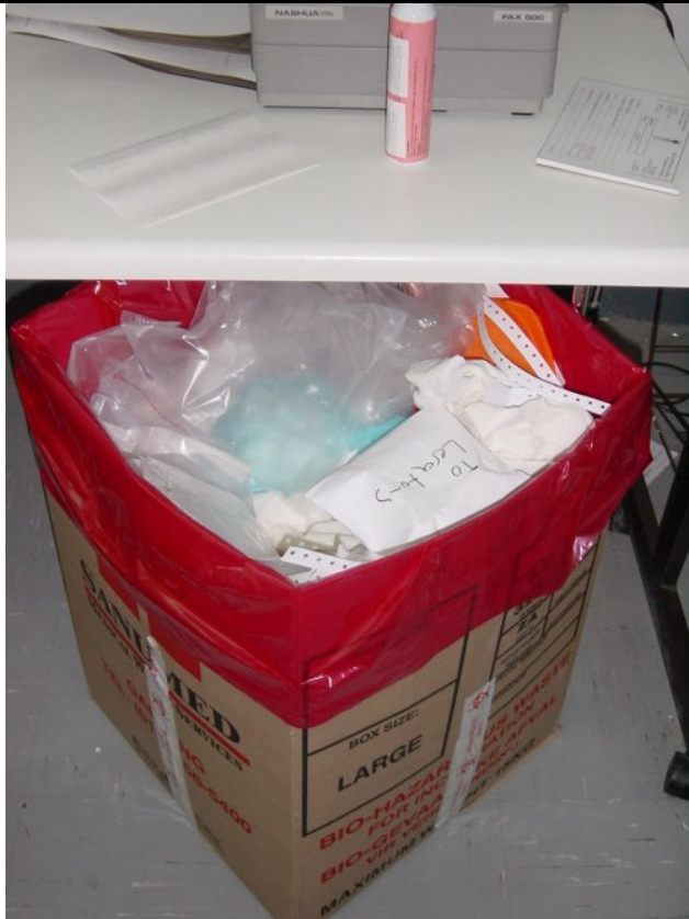
140 litre Cardboard box receiving HCRW in the wards