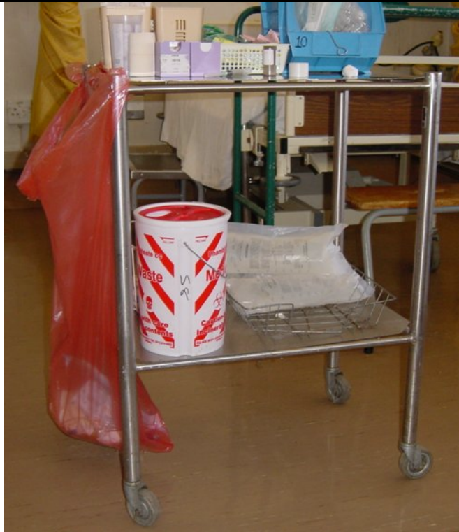
Nurse trolley with red bag hanging loose fixed with tape