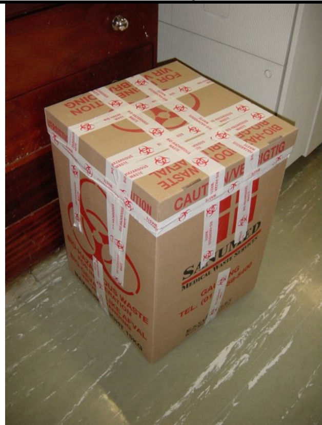
Filled 140 litre cardboard box sealed and awaiting collection