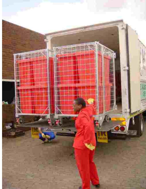
Wheeled transfer of stackable boxes using lifting tail gate