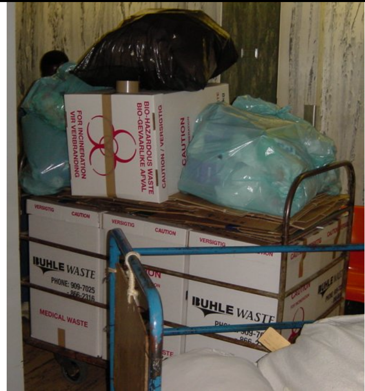
Internal collection of cardboard boxes with HCRW