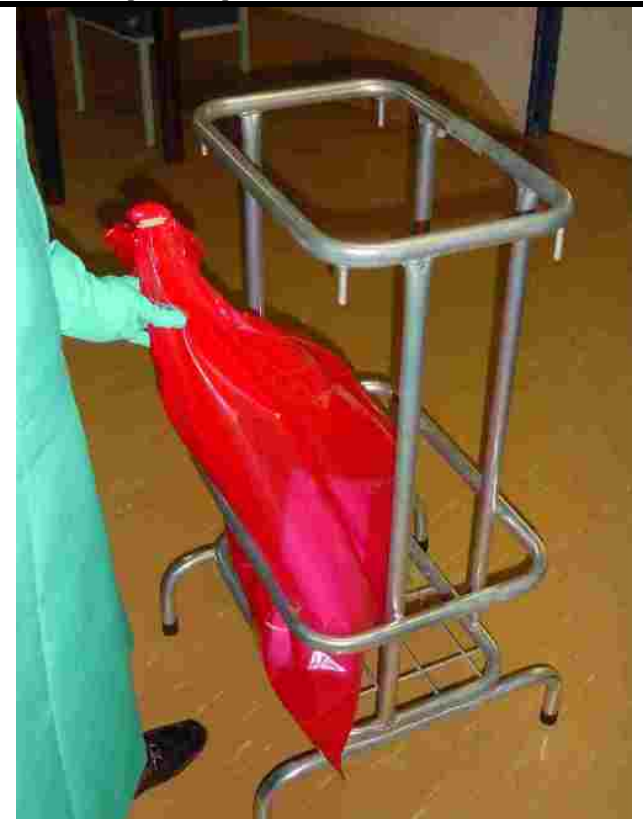
Filled thick red liner being removed from stand in sluice