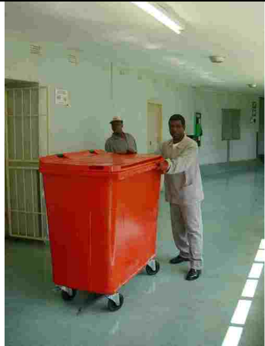
Internal collection of thick liners using 770 litre wheelie bin