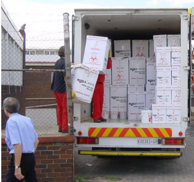
Manual transfer of non-puncture proof cardboard boxes to truck