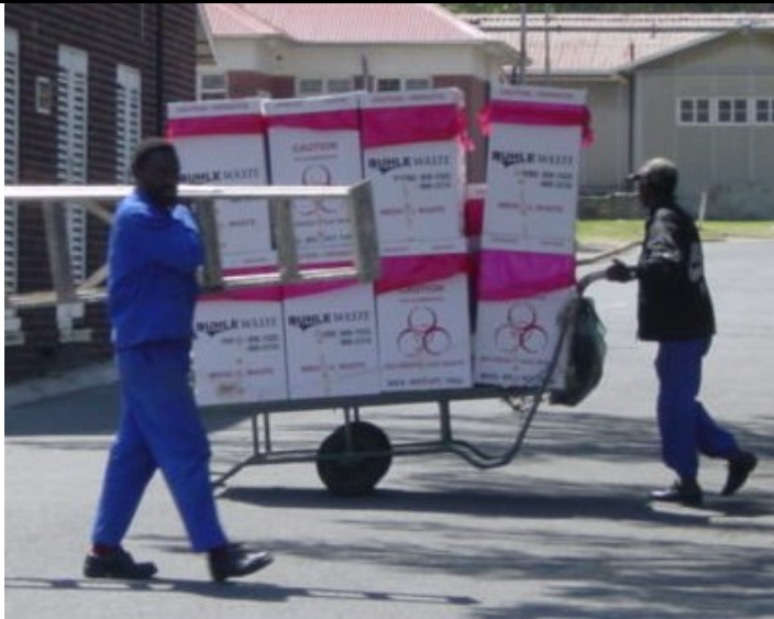
Internal collection of cardboard boxes with HCRW