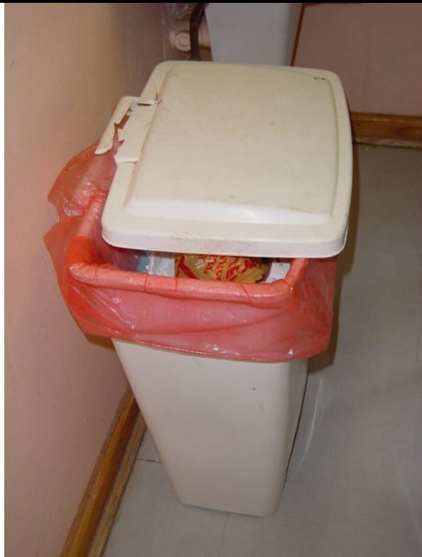
Broken pedal bin for HCRW in sluice room