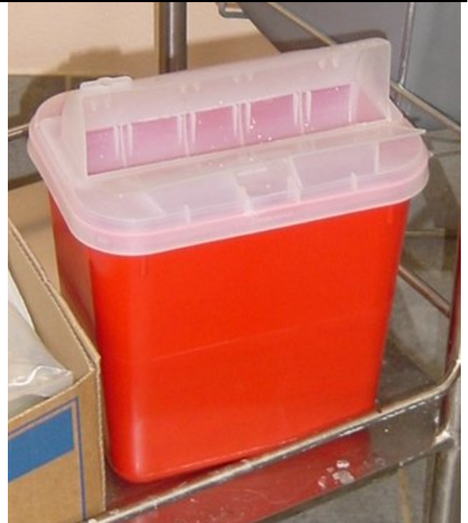
Sharps container with horizontal loading via safety sluce