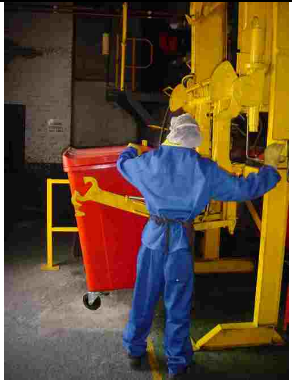
Mechanical lifting of wheelie bins into hopper of incinerator