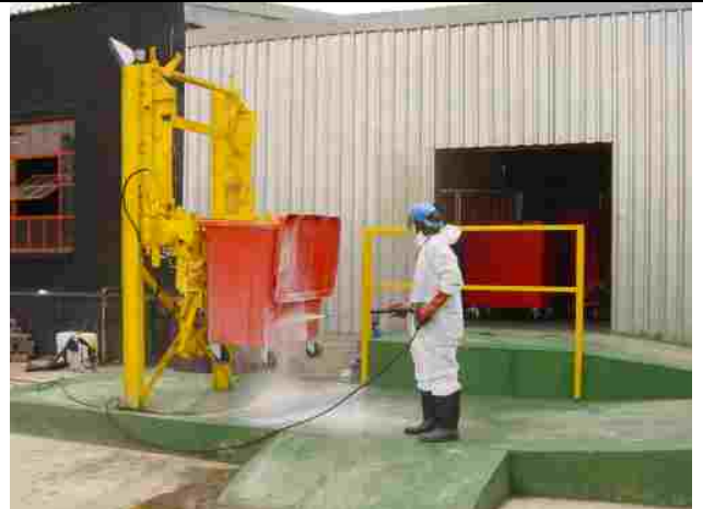
Washing and disinfection of 770 litre wheelie bin