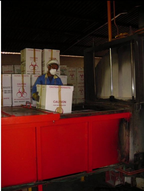
Manual feeding of non-puncture proof cardboard boxes to incinerator